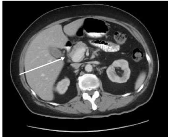
Figure 1. Axial section of CT scan shows a dilated (1.8 cm AP diameter) superior mesenteric vein without internal thrombosis.

technology and computer software. The multiplanar capability of magnetic resonance imaging (MRI) along with the capacity to render angiogram-like images of vascular structures makes MRI well suited to the evaluation of such an aneurysm. In the past,